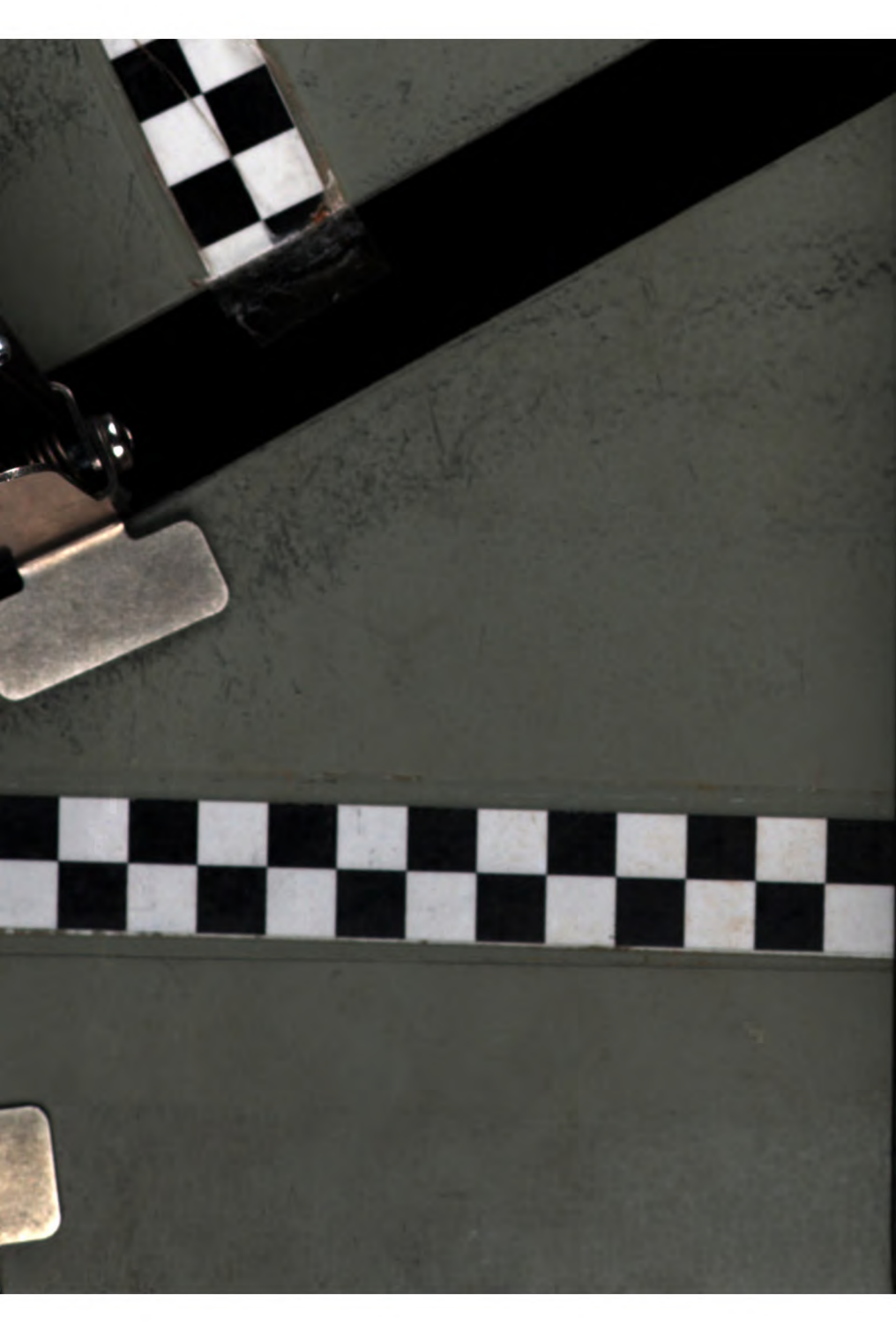
Digitized by Google